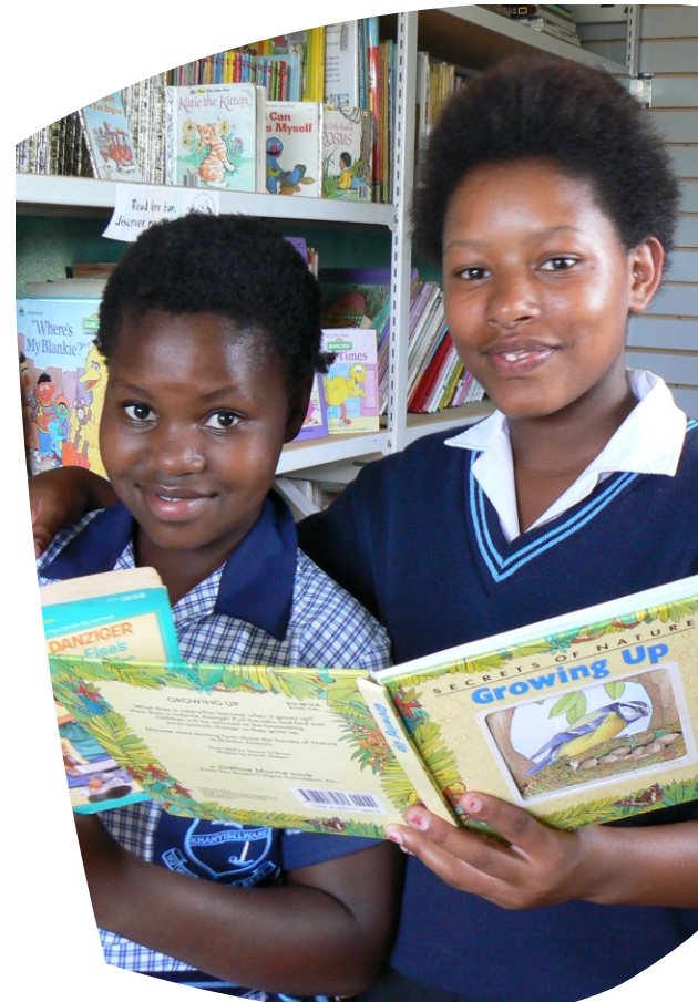
Smile Africa Library – Soweto, South Africa