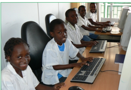
Smile Africa's DtT Program, Angola – Nov. 2006